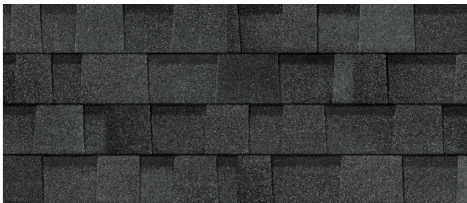
Twilight Black †