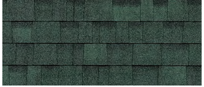
Chateau Green †

Not Available in Service Area 1 (see map).