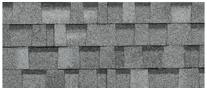
Sierra Gray †