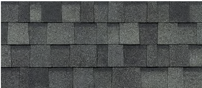
Estate Gray †