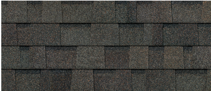
Peppermill Gray †