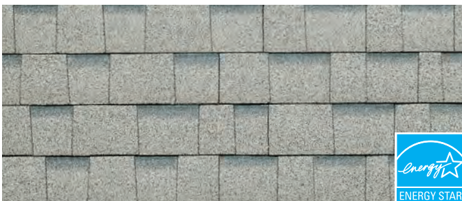
Shasta White †