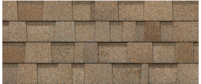
Sand Castle †