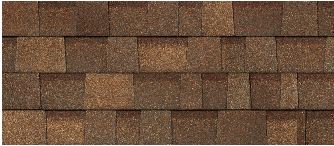
Aged Cedar †