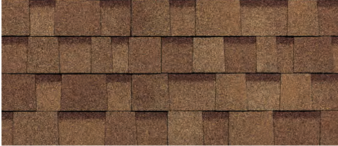
Desert Tan †

Not Available in Service Area 1 (see map).