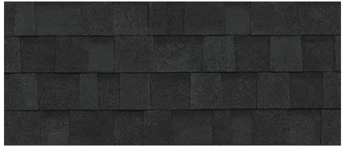
Onyx Black †